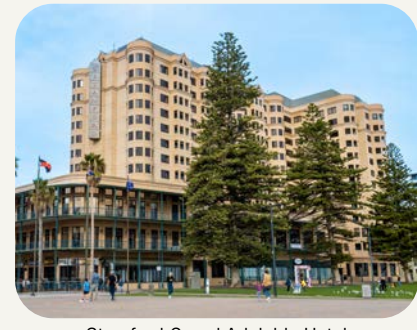
Stamford Grand Adelaide Hotel 2 Jetty Rd, Glenelg SA 5045